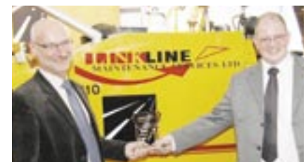
The prize was presented to Borum at a festive gathering at Intertraffic 2006.

Borum is naturally very proud of being chosen, and the award of the prize was celebrated with a glass of champagne at Borum’s stand at Intertraffic 2006 in Am-