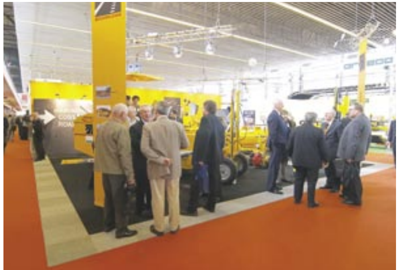
There was a great deal of interest in Borum's new machines at Intertraffic.

Borum's customers were very enthusiastic about these new models, and have placed orders for many of the machines - so many, in fact, that in the spring of 2006, Borum could record the greatest order influx in the company's history.