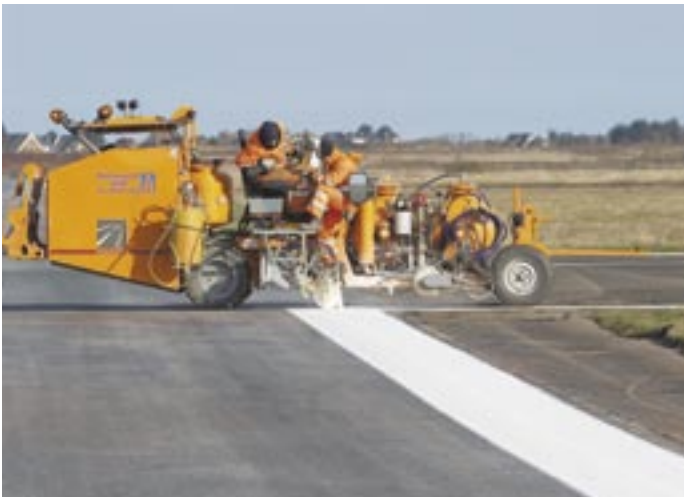
Markierung NF re-marks the airport on Sylt using a BM C 350-2A with airport marker.

Borum has supplied machines for airport marking for many years, including a BM 500 equipped with an airport marker for Thule Airbase in arctic North Greenland, where the climate and the short period of time available for marking during favourable periods of weather make extreme demands on the machine.