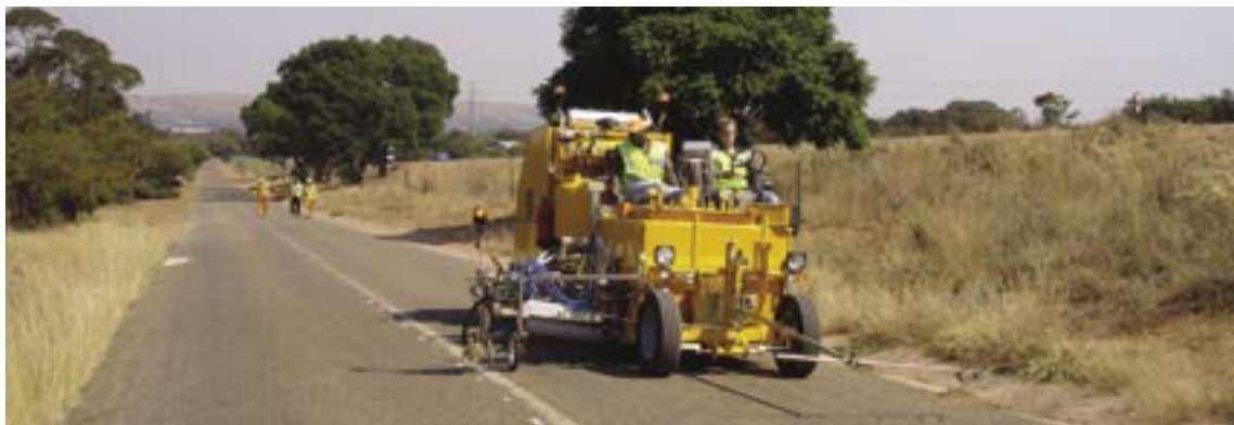
On-site training with one of Borum's South African customers, who has just received a Borum machine, a BM SP T 500-2.